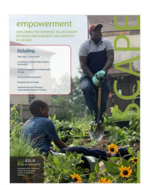
_SCAPE 2023 ISSUE 1