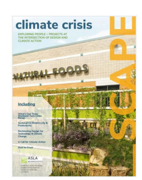
_SCAPE WINTER 2022