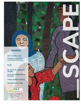
_SCAPE SUMMER 2021 October 25, 2023