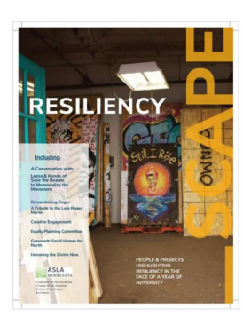
_SCAPE WINTER 2021